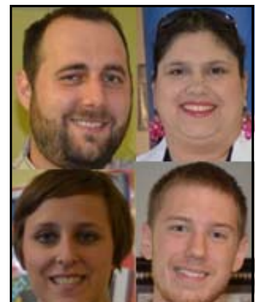
New teachers at Veritas

One cool fact about him is that he has a blue belt in taekwondo.