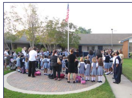
Veritas gathered around the pole