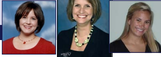
Photos: New Elementary School Teachers